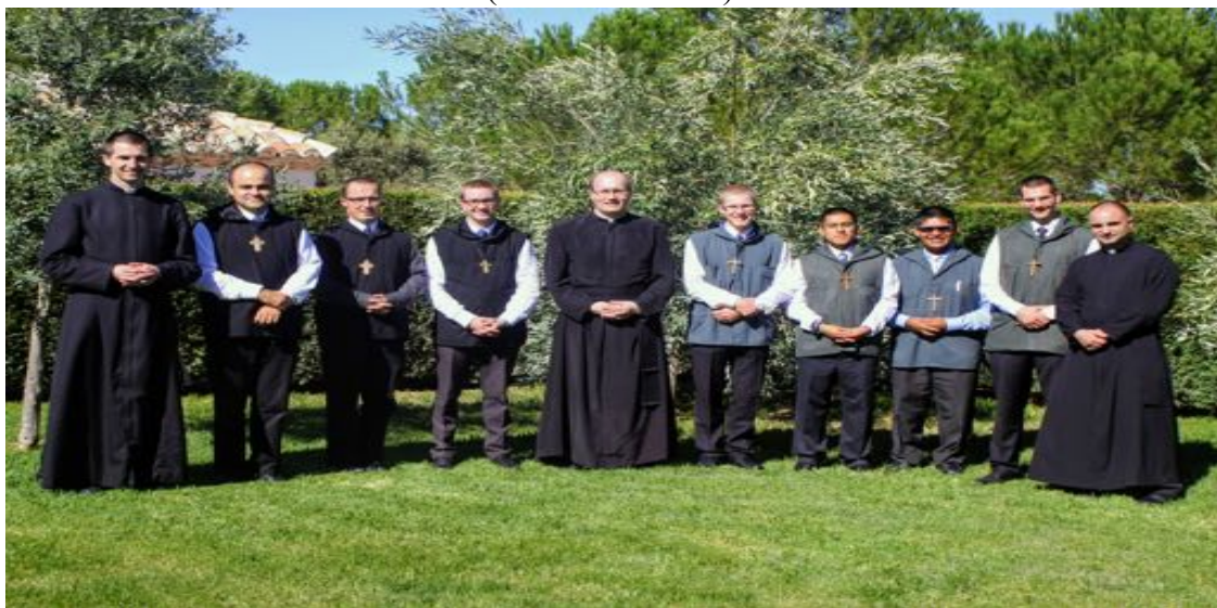
(To be continued)

For this reason, in each Tabernacle of each House of the Missionary Servants of the Poor, that image of broken bread reigns, with the eloquent expressiveness of the food chosen by Christ to perpetuate among us, throughout the centuries, His presence as Bread of Life.